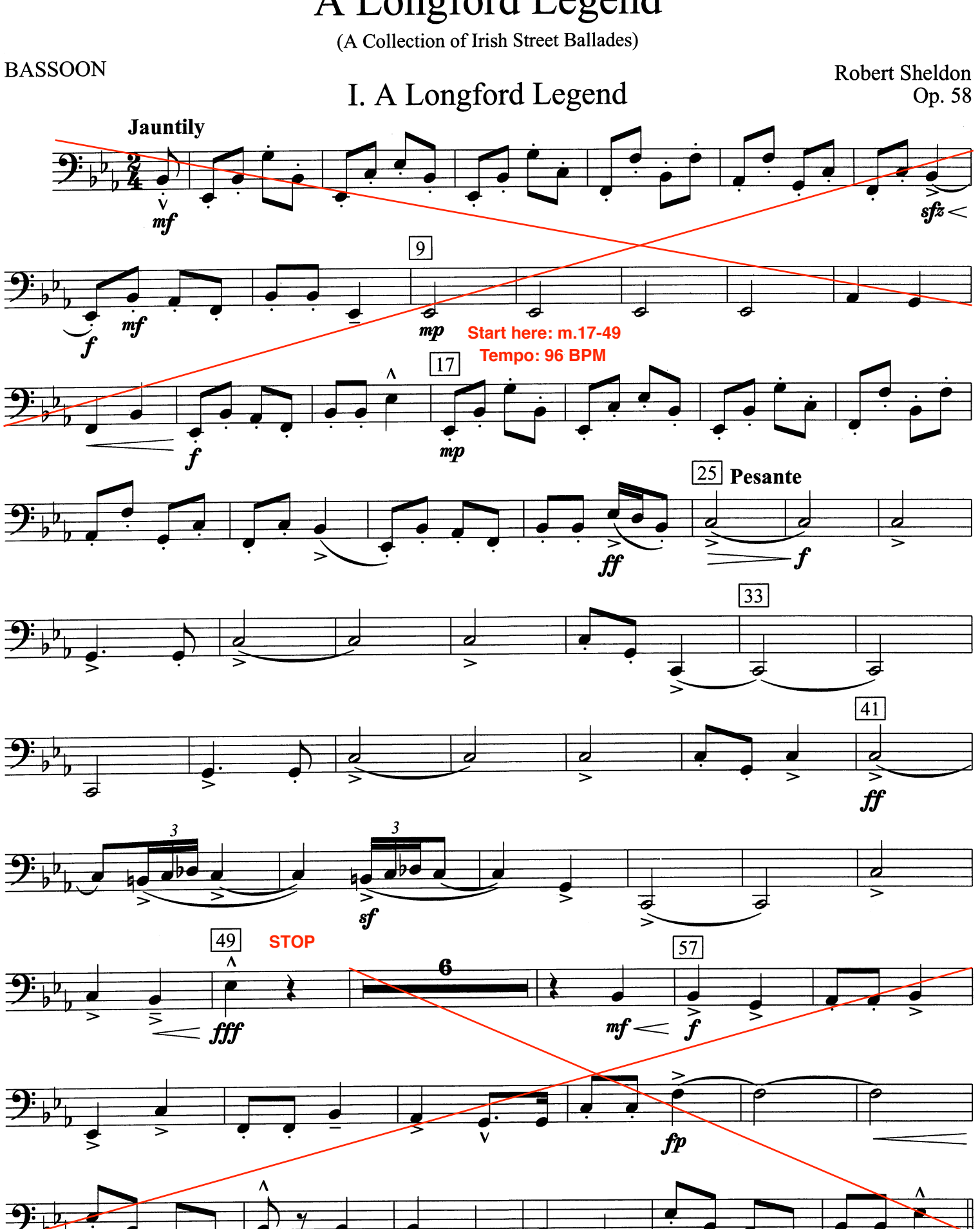
Copyright © MCMXCVIII by Alfred Publishing Co., Inc. Printed in USA. All rights reserved.